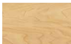
6381 Maple Design