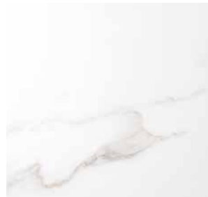
7029 Tanami Gloss