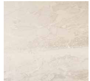
7097 Boulia Gloss